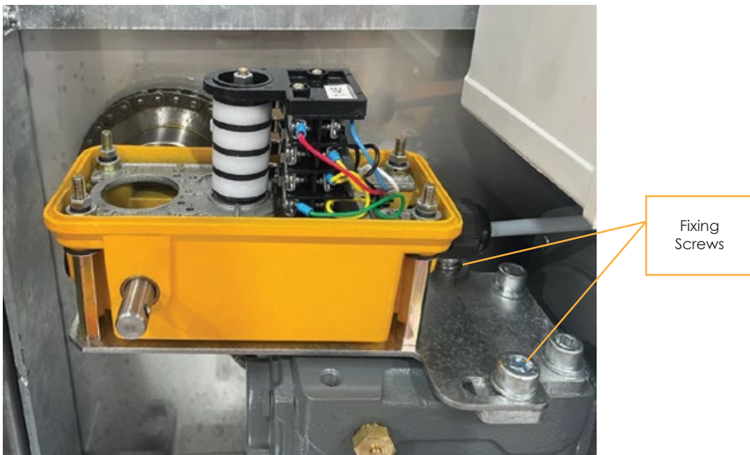
Pic 1: Limit switch fixing screws

Remove the fixing screws which secure the limit switch mounting plate to the Gate Operator as per Pic 1 below.