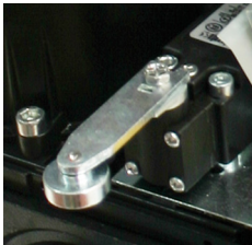
BUILT-IN LIMIT SWITCHES