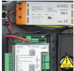
UNIGATE INVERTER EQUIPPED