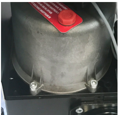
OIL BATH LUBRICATION